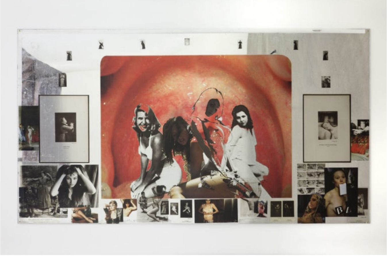
'Esophagus Pin Up,' 2016 COURTESY OF KANDIS WILLIAMS AND NIGHT GALLERY

Kandis Williams' artistic practice often confronts themes of race, femininity, and psychology. She is known for creating large-scale black-and-white collages, but she also incorporates drawing, performance, choreography, and photography into her work. The way she splices images of the human body, layering and appropriating limbs, draws attention to the functions of flesh. A viewer might see fighting figures or heads floating in abstract landscapes—all bringing attention to the qualities of human interactions and presence in specific spaces.