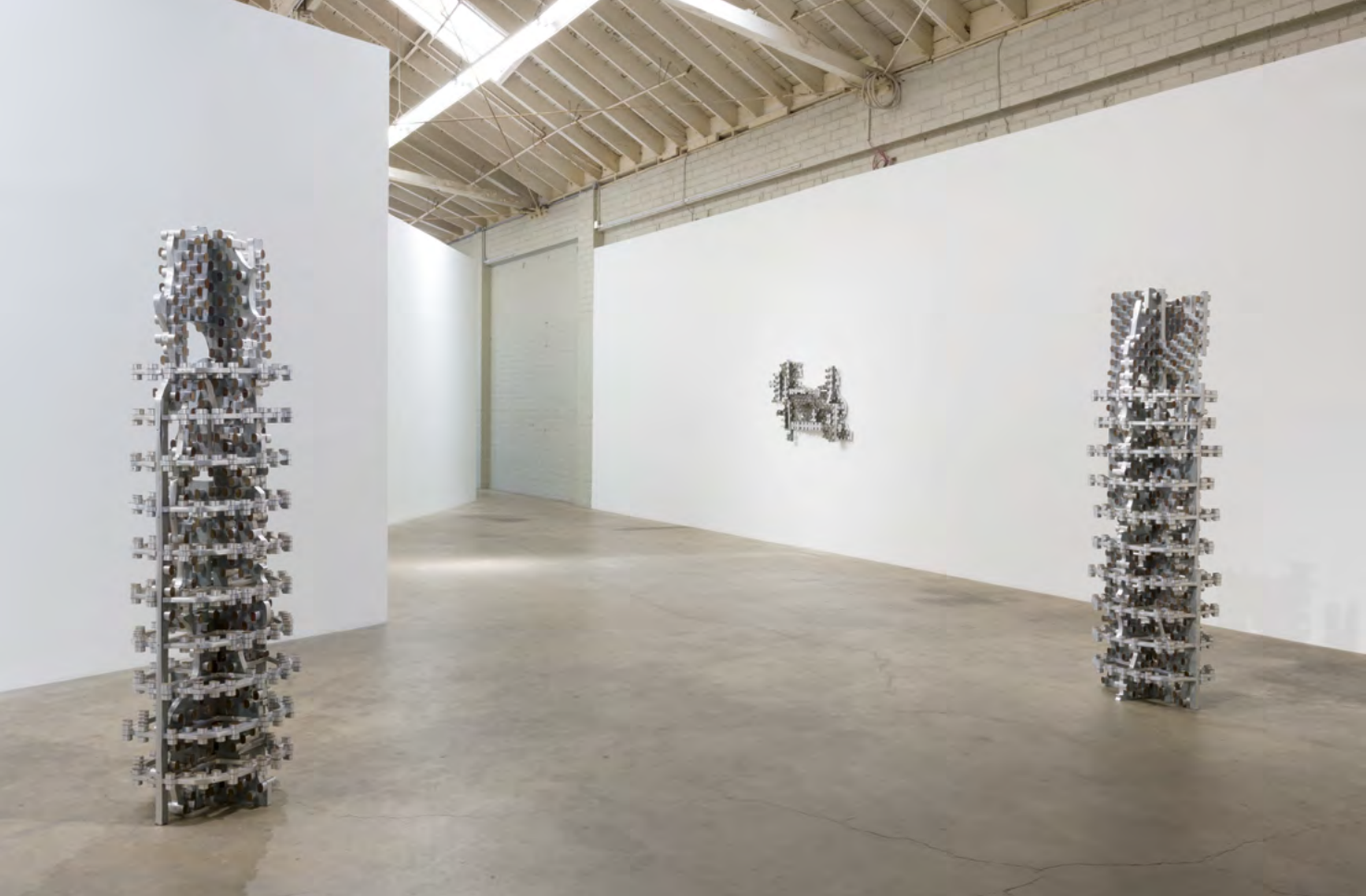
Earthflash (Installation View), 2018, materials variable, dimensions variable

AL These works opened things up for me and I pulled a lot of ideas from them. I think the work in many ways is so linear and it often leads to other possibilities. I continue to add and subtract different adjectives.