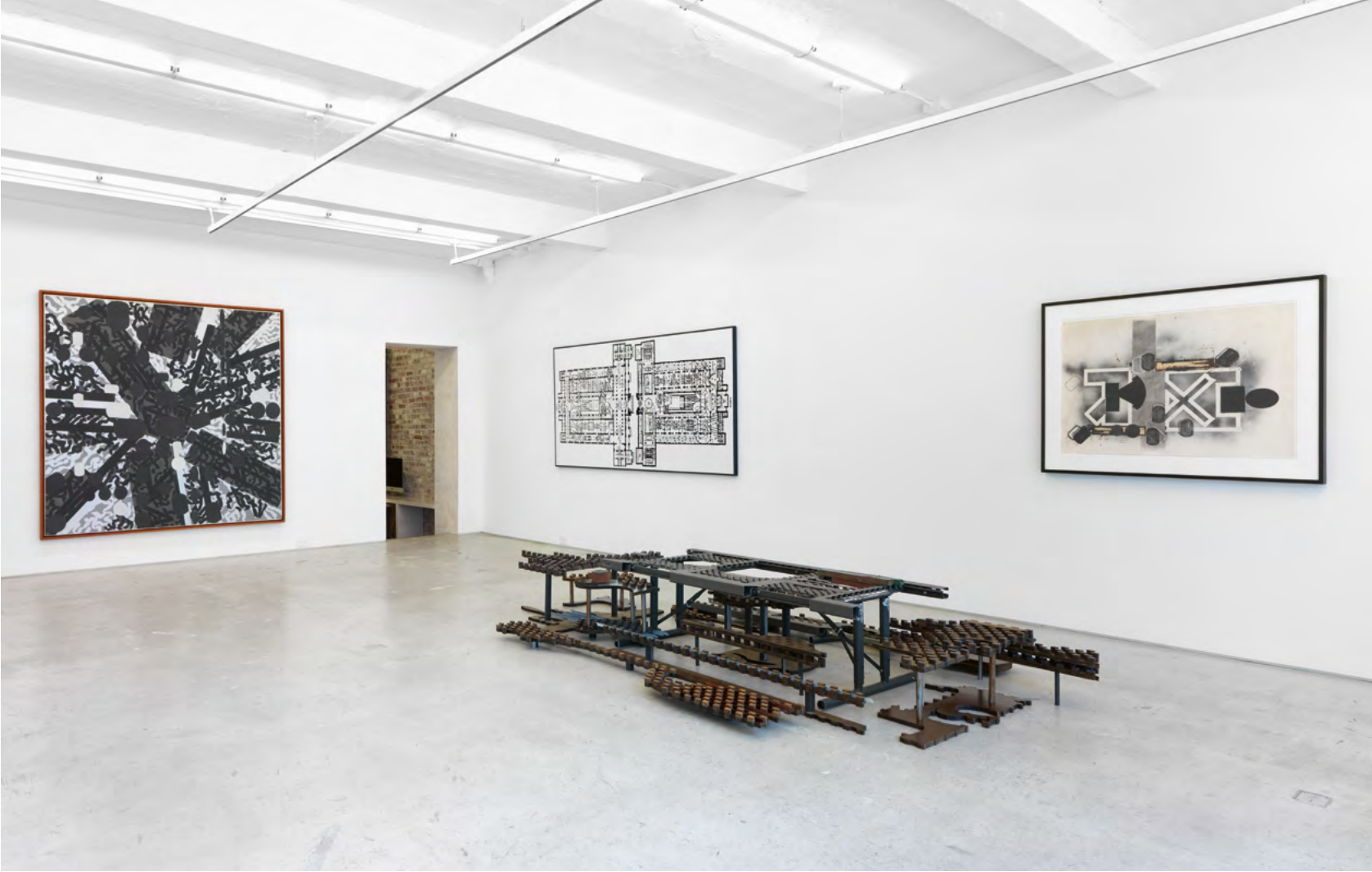
Nagy / Libby / Le Va (Installation View), Magenta Plains, 2017, materials variable, dimensions variable

ML During some of our first conversations, I was struck by the types of subjects that have informed your