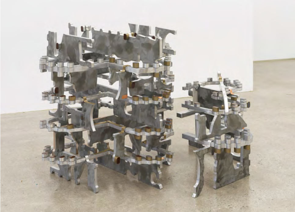
The Cannibal Dynamic , 2018, plywood, pigmented urethane, venetian blinds, formica

ML You're often working on a number of different sculptural forms at any given time. For example, you've created low-lying horizontal sculptures, vertical freestanding towers, wall-mounted reliefs, and most recently, quilts. Are you continuing to move between these types of objects?