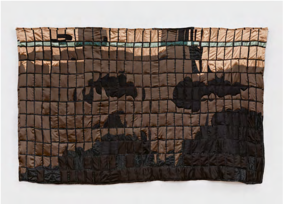
The Sky and the Gig, 2019, satin, batting