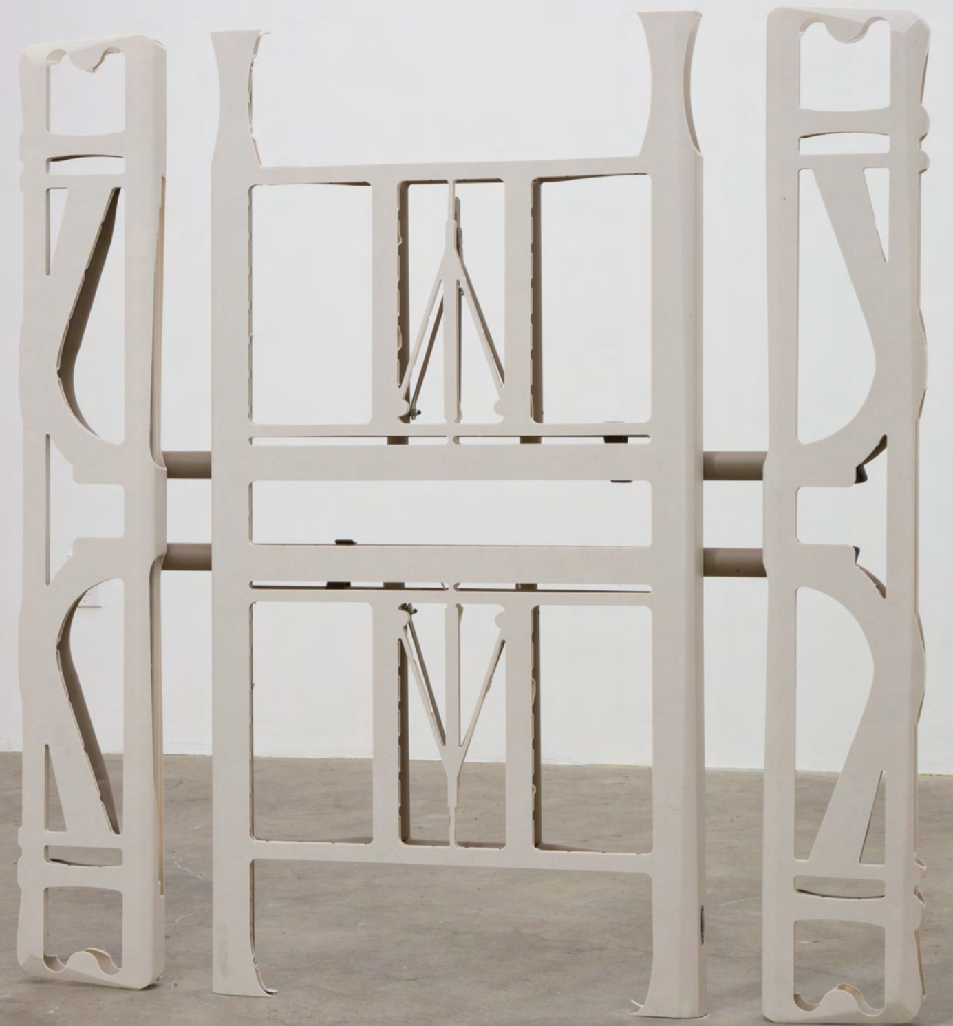
Winged Victory (Beige Sand), 2015, polyethylene, powder-coated steel, 167.64 x 152.4 x 10.16cm. Opposite: Untitled, 2019, plywood, pigmented urethane, aluminum Venetian blinds, formica