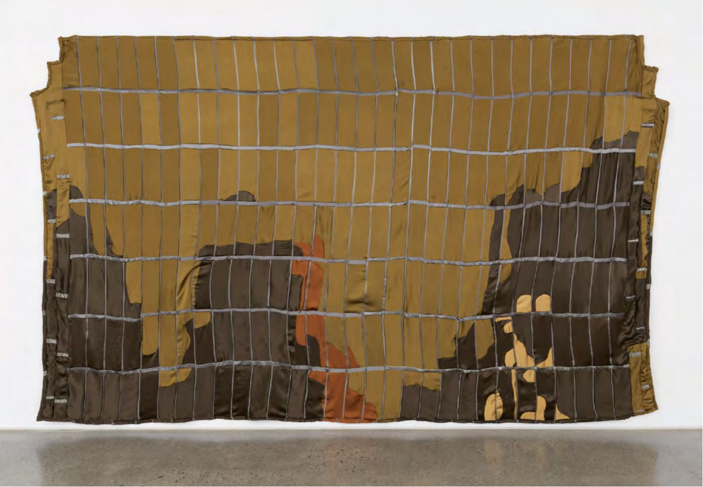
Sunset Gates, 2018, satin, batting