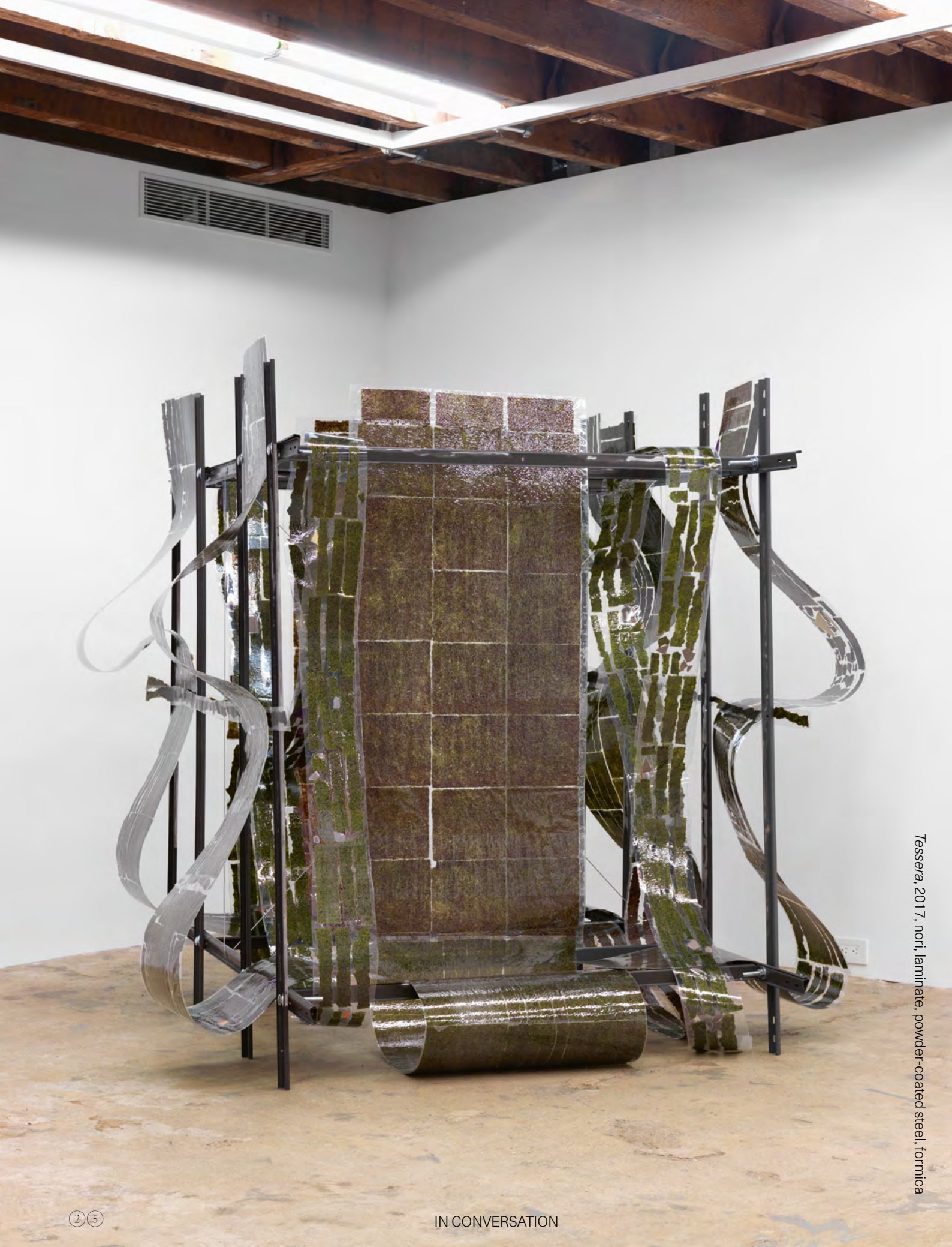
Tessera, 2017. nori, laminate, powder-coated steel, formica