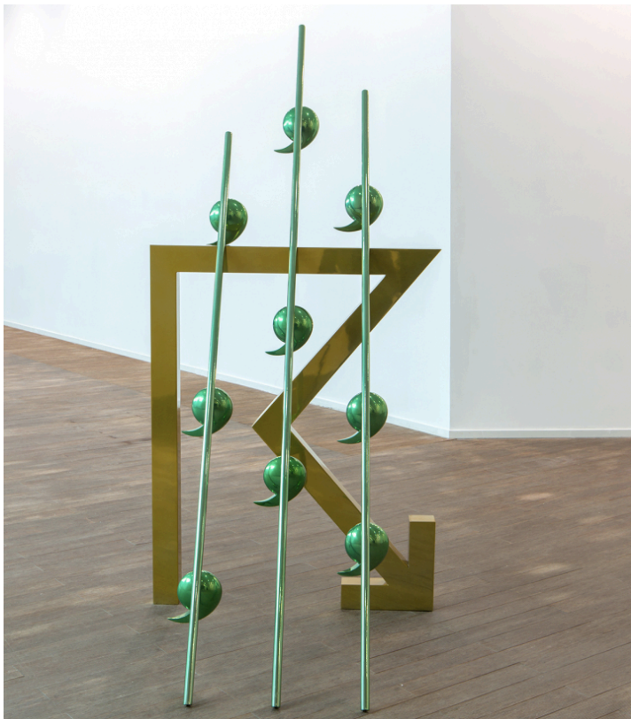
Bigert & Bergström, "Teutoburg Forest 9 CE (2017), painted stainless steel, (courtesy of the artists and Belenius Gallery, Stockholm)

Weather Report thus raises the question of how art can best to communicate information about the planet's climate. It's a question whose implications extend beyond the realm of aesthetics. However dazzling, artworks that show a bird's-eye perspective— a crowd-pleasing sub-genre of landscape art — that includes work by contemporary artists such as Ed Burtynsky and Zaria Forman — increasingly feel dissatisfying. For example, segments of Ellen Harvey's enormous, painstakingly detailed black-and-white painting, in acrylic and oil, of Florida Coastline, "The Mermaid: Two Incompatible Systems Intimately Linked" (2019) — designed to span a 100-foot-wide wall in the Miami Beach Convention Center as part of the Miami Beach Art in Public Places Program — impress simply by virtue of their size. But, at least when installed in a geographically distant gallery, the painting's impersonal vantage point minimizes the coastal region's imperiled, ground-level climate realities.