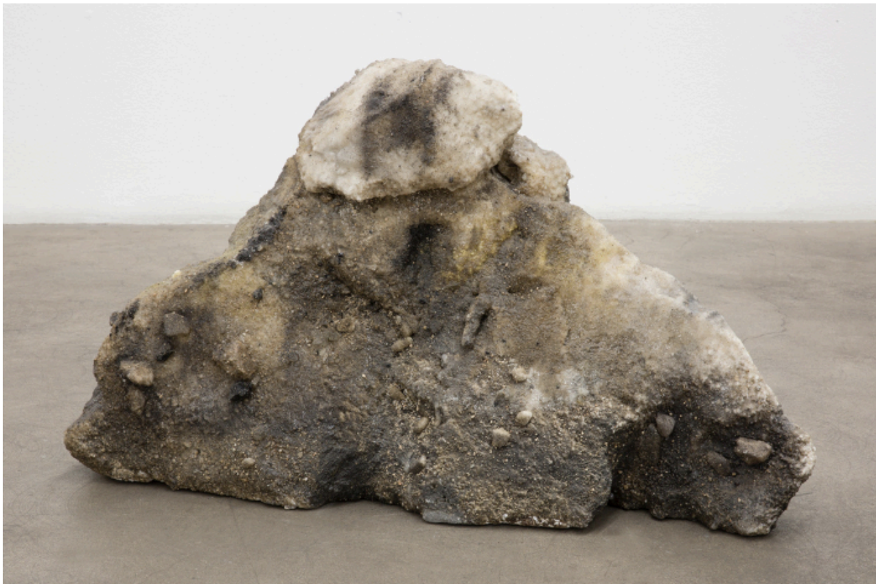
Josh Callaghan, "Chicago Snow 6" (2013), EPS foam, urethane resin, sand, marble, glass

Humor can perhaps convey a more effective sense of the distance between our ant-like human lives and the larger climatic forces threatening the viability of those lives as we've known them. Smartly situated in the same room as Graves's and Harvey's paintings, Swedish duo Bigert & Bergström's sculptures, "The Russian Campaign 1812" and "Teutoburg Forest 9 CE" (both 2017), depict weather events that influenced the course of military history as pop-camp versions of weather report graphics. The shiny and colorful painted stainless steel objects—a group of Shamrock green bars from which dangle apostrophe-shaped raindrops; silver, asterisk-shaped snowflakes clustered on the floor—playfully send up the way in which meteorology's visuals abstract weather from its harshest historical and experiential consequences.