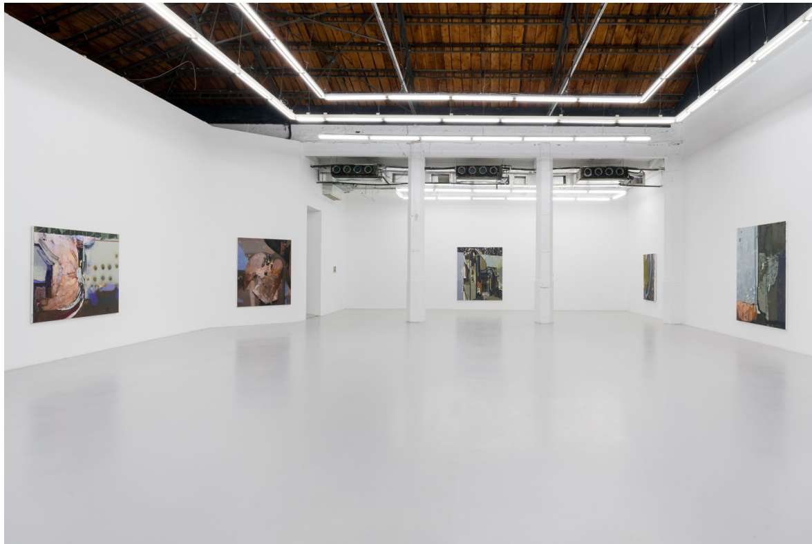
Han Bing, "Han Bing: A Labile Boundary at Best." Exhibition view at Antenna Space, Shanghai, 2020.

To achieve such an ambiguous and compounded emotional response to her images, Han Bing has been adopting the approaches of collage and spray paint in her painting practice. These most iconic approaches of art in modern Americana, the former identifies with the picture generation and the latter with graffiti and street culture, are indeed the perfect registers for Han Bing's indecipherable and often, uncanny images. The good, the tough and the complex (2019), Peaceful satire (2019), The hedonistic wound (2019) among others, even further removed from any specificity – both with regards to time and place, at the same time, their nearly life-size dimensions draw the viewer into the vertigos of complexity vested in them. These visual tropes, increasingly apparent on the artist's canvases, shed light on Han Bing's engagement with the cultures she has dived further into.