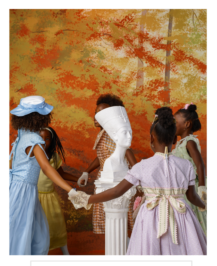
LOVE IS BOND (YOUNG QUEENS), 2018-20. COURTESY THE ARTIST AND BEN BROWN FINE ART.

Themes of empowerment and Islamic spirituality further Erizku's exploration of global Blackness . In "Malcolm x Freestyle (Pharaoh's Dance)," 2019-2020, civil rights leader Malcolm X, who advocated for alliances between the Black activism in the US and Independence movements abroad, is represented by a visually complex still life portrait. Including a bust of Nefertiti, a hammer, a gun and a panther, the work reflects Erizku's interest in bringing together iconic references to question what it means to be Black. In "Ramadan Drawings," April 23-May 23, 2020, Erizku uses incense, ash and a basketball on the surface of the paper to produce a series of quiet, meditative pieces. His poignant video, "Bird Talk, Time I Danced for the Moon," 2020, captures the reflections of a man walking up the hill to the iconic Hollywood sign, musing on his experiences of bigotry in the US. In another video, "Mystic Parallax: Visual Manifesto," 2020, a woman recites the Shahada, the Muslim declaration of faith, while Robert Farris Thompson's book, Flash of the Spirit , is seen going up in flames. The work speaks to the complex relationship between monotheism and polytheism in Africa, symbolically destroying a book representing a Westernized history of African diasporic culture.