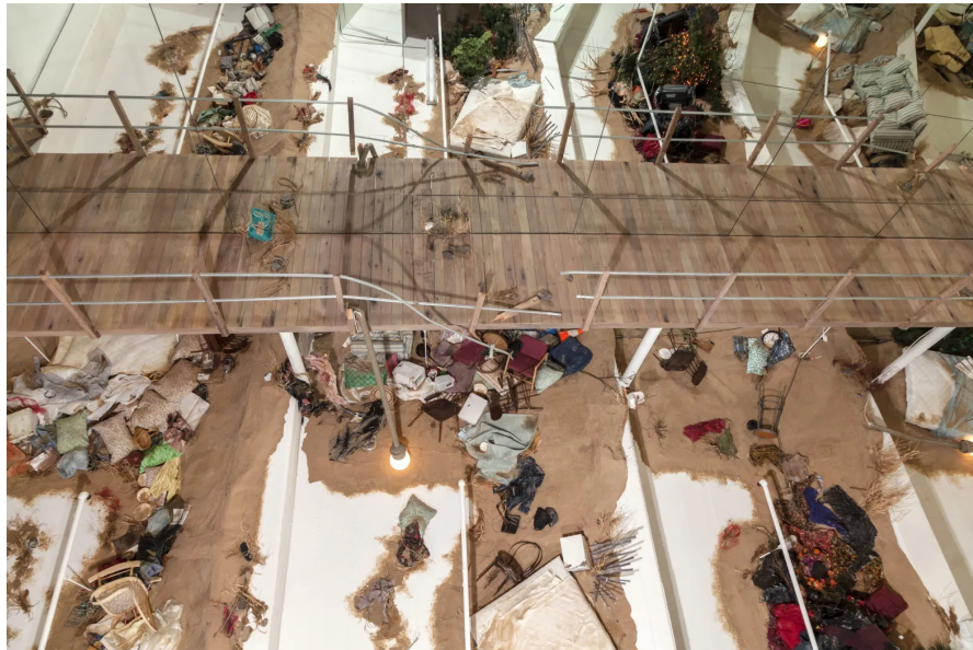
Samara Golden, in collaboration with the Fabric Workshop and Museum, Philadelphia, Installation view of Upstairs at Steve's (2020), mixed media, 80 feet 7 inches x 17 feet 6 inches x 16 feet

Upstairs at Steve's is a contemporary memento mori. Rather than genre staples of dying flowers, skulls, and ticking clocks, Golden's tableau seems to embody ephemerality itself. Installed on the museum's eighth floor, the mirrored walls and floor transform a sliver of a gallery into a vast arena, viewable from a wooden deck. Simultaneously evoking a lighthouse and a chapel, a stained glass window is multiplied by reflection into a dazzling arcade. Sandy dunes are strewn with the remnants of a life — household objects, furniture, clothing — like the aftermath of a hurricane. Hallucinatory dream-logic complicates the otherwise unsubtle metaphor of natural disaster for personal tragedy.