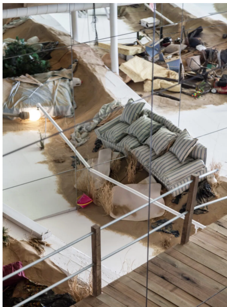
Samara Golden, in collaboration with the Fabric Workshop and Museum, Philadelphia, Installation view of Upstairs at Steve's (2020), mixed media, 80 feet 7 inches x 17 feet 6 inches x 16 feet

Upstairs at Steve's is a contemporary memento mori. Rather than genre staples of dying flowers, skulls, and ticking clocks, Golden's tableau seems to embody ephemerality itself. Installed on the museum's eighth floor, the mirrored walls and floor transform a sliver of a gallery into a vast arena, viewable from a wooden deck. Simultaneously evoking a lighthouse and a chapel, a stained glass window is multiplied by reflection into a dazzling arcade. Sandy dunes are strewn with the remnants of a life — household objects, furniture, clothing — like the aftermath of a hurricane. Hallucinatory dream-logic complicates the otherwise unsubtle metaphor of natural disaster for personal tragedy.