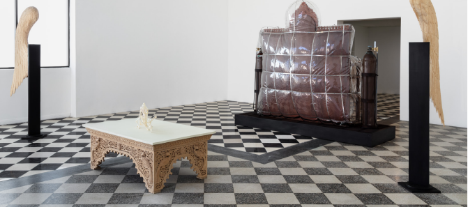
Sean Townley, Bad News from the Colonies (installation view) (2020).