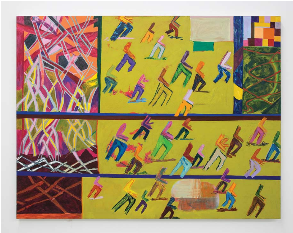
Marisa Takal/Courtesy of Night Gallery

then, more than 200 people have donated items for sale. "It's moving," she says, "that every kind of person has jumped in to give up a nerdy thing they truly cherished."