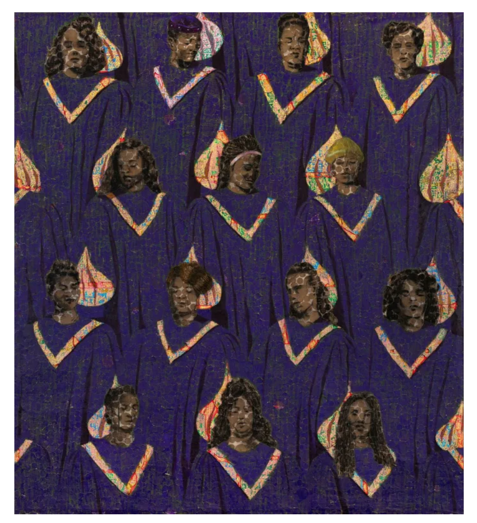
'Chorus of Maternal Grief' (2020) © Courtesy the artist, Petzel, New York and Josh Lilley, London

"I once heard optimism described as a survival instinct," Fordjour replies when asked if he is optimistic for social change. "I am probably more concerned with survival, especially as an artist. The hope is that your life's work survives . . . the oeuvre itself is decidedly more dubious and questioning."