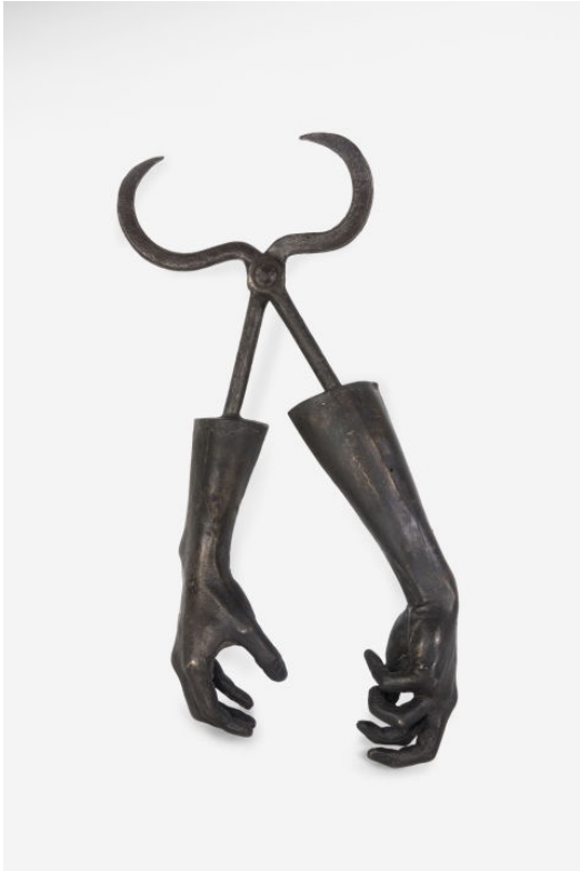
'Unraveling,' 2016