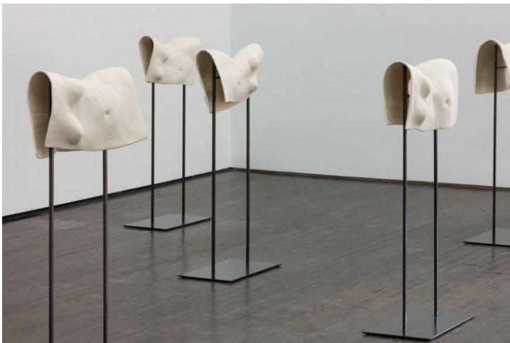
'Pommel,' 2017