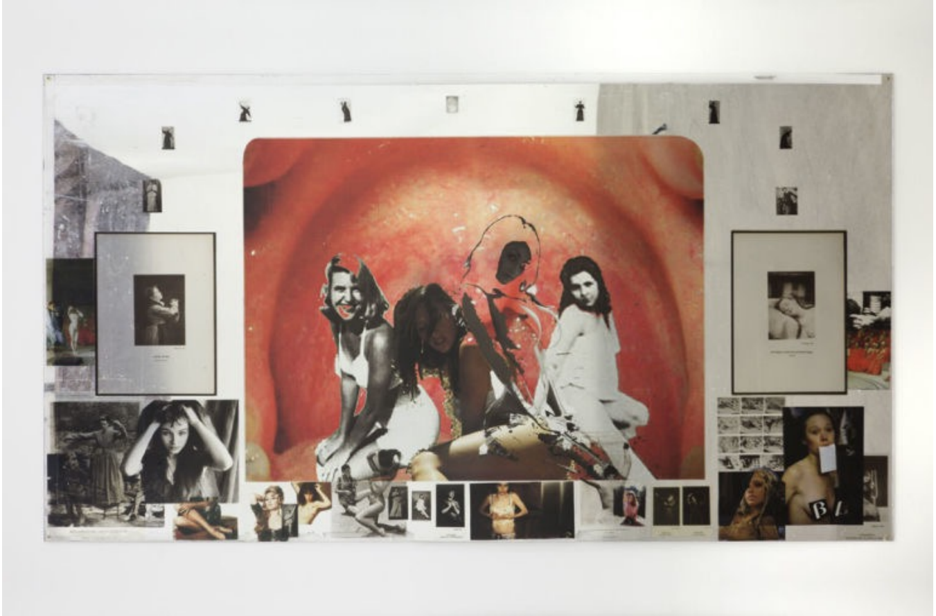
'Esophagus Pin Up,' 2016

COURTESY OF KANDIS WILLIAMS AND NIGHT GALLERY