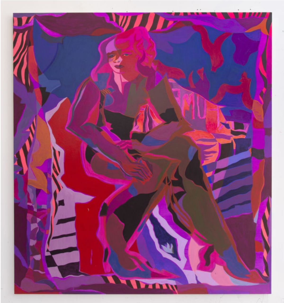
'QBS Shadow Bloom,' 2016