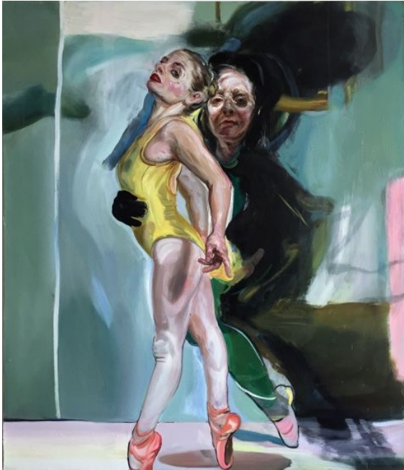
'Dancer I,' 2016-7