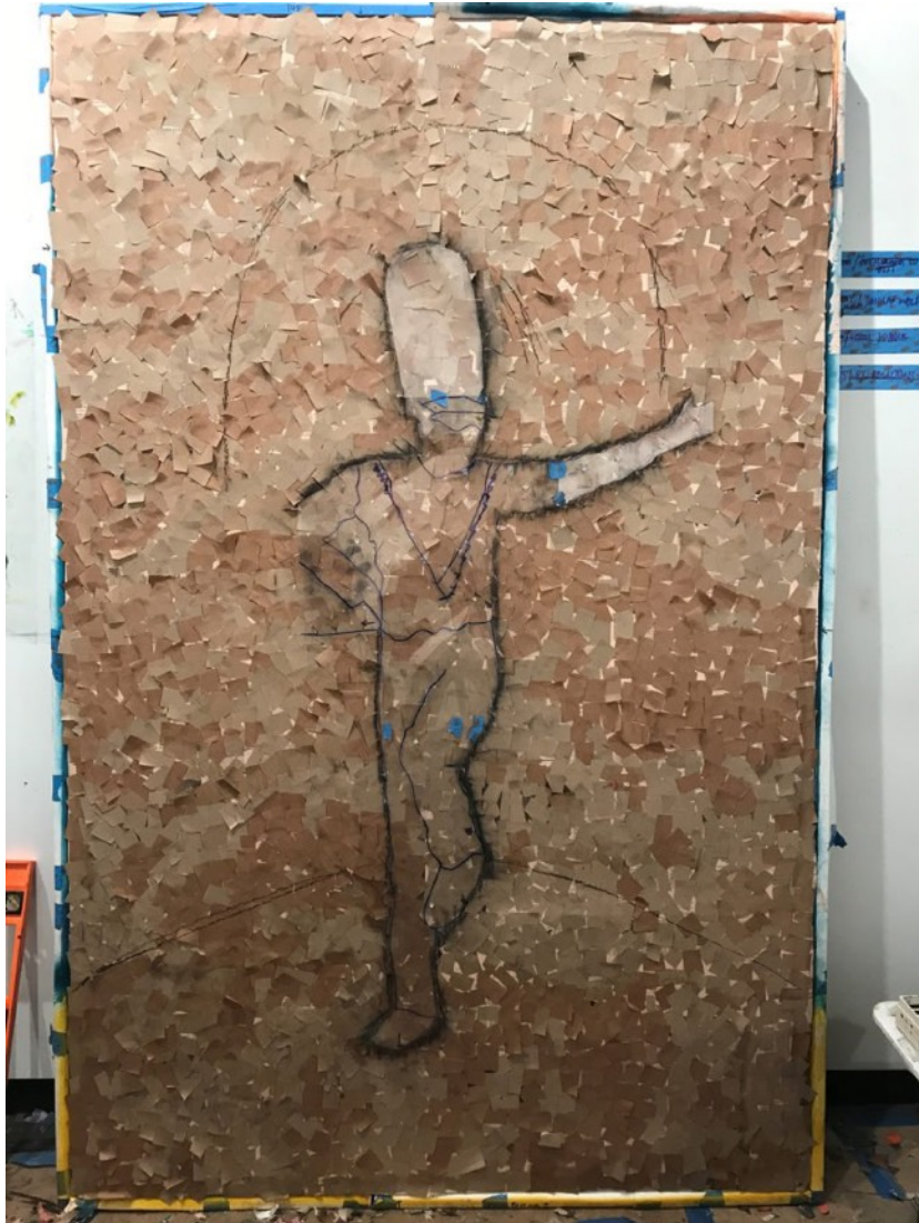
Derek Fordjour's The Drum Major (2017), process shot.

There's some kind of logic to it, I think that's intuitive. The coloring and the spacing, it might be beyond language, honestly. It's just very intuitive, the way I balance color.