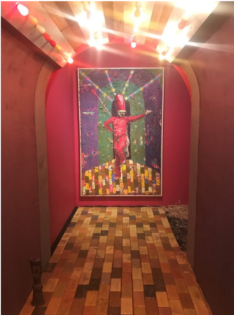
Derek Fordjour's The Drum Major (2017).

I'm really attracted to that notion of our institutions and our homes having that kind of used, worn, quality but still trying to have dignity about it, and make it something new. That kind of wear and tear, that's kind of what it's about.