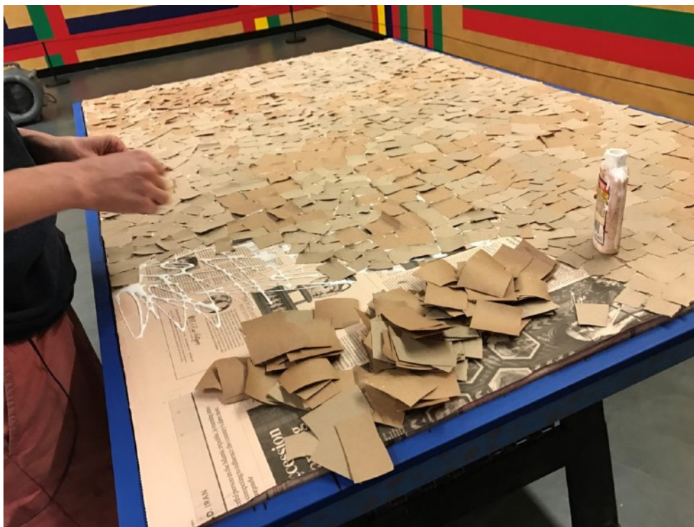
Derek Fordjour's The Drum Major (2017), process shot.

Through a series of cuts and tears, painted and drawn marks with spray paint, charcoal, acrylic, and oil pastel, the final surface alternately conceals and reveals underlying layers to create a rich, textured surface. There's a relationship between the under-image and the top image.