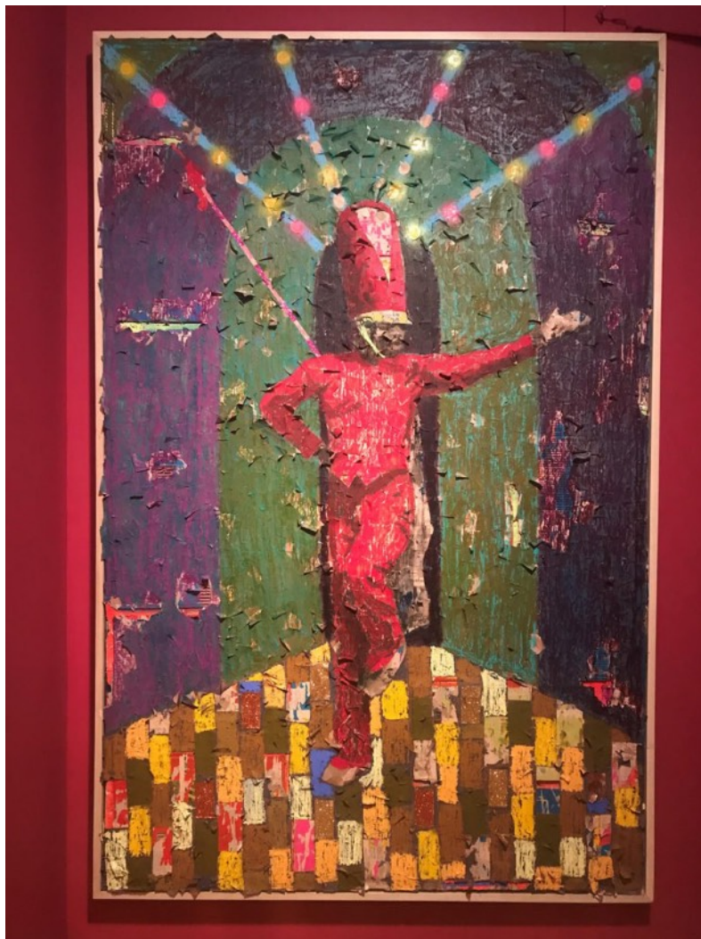
Derek Fordjour's The Drum Major (2017). Photo courtesy of Derek Fordjour.

For this edition of "Origin Story," in which we examine the backstory of an individual work of art, Fordjour walked us through the creation of The Drum Major , a painting of a triumphant figure in red which greets visitors at the entrance of the show.