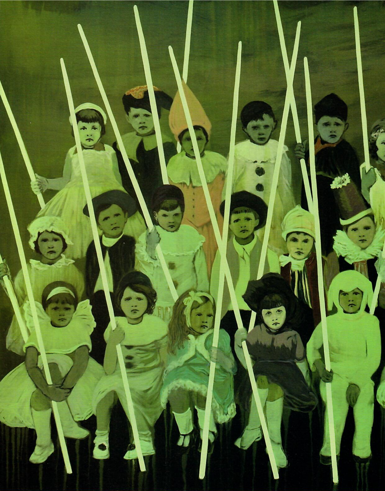
Claire Tabouret Les Veilleurs 2014 Acrylic on canvas 230x400 cm