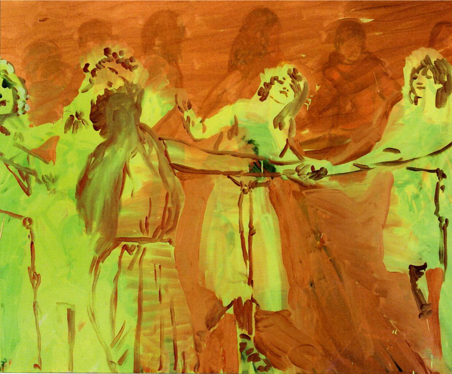
Claire Tabouret Circle Dance (gold sun) 2017