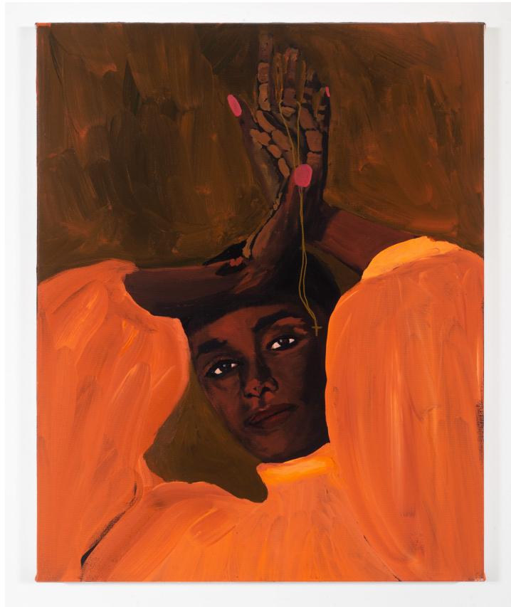
Let's Be Real, 2021

Her process as a painter still relies on photography for references, employing interiors often inspired by posts on Architectural Digest and Dwell's Instagram accounts, MENU pictures her husband sends her, and others images cut from magazines. "I travel through photographs," she explains. "I used to cut out people and interior spaces from magazines for hours as a child, so I think subconsciously I go back to that." Those references are then suffused with whatever emotion and feeling that she wants "to project into that moment". Her paintings, unlike the photographs, aren't indebted to anyone, and they don't owe the viewer any explanation. They can exist autonomously, because their subjects don't exist in reality. "The medium challenges the notion of what it represents. The paintings tell a completely different story".