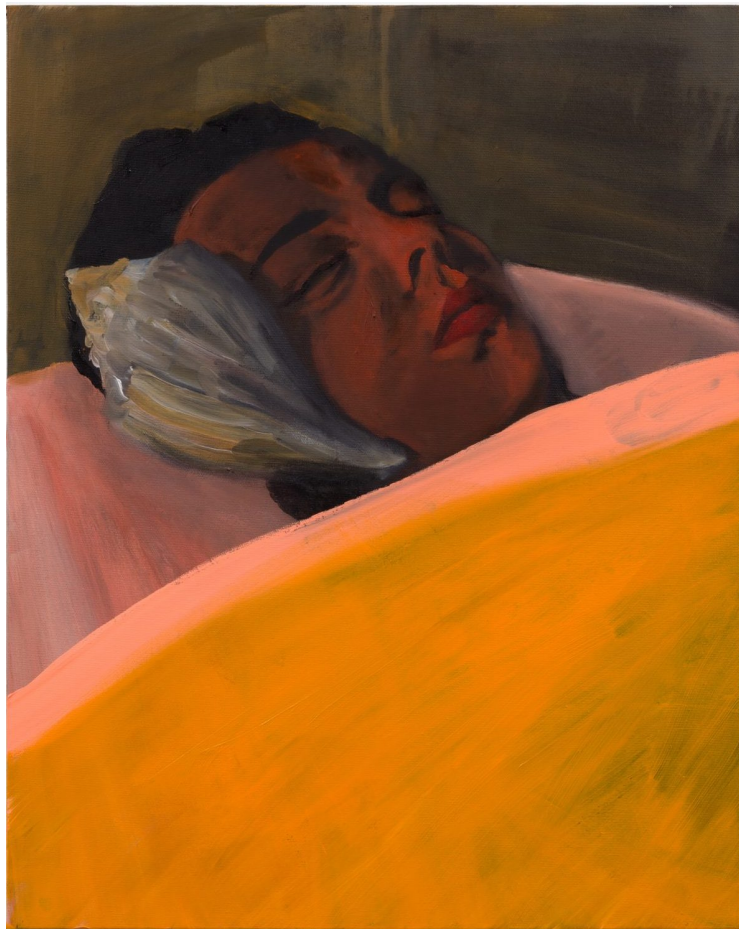
Dreamer , 2021